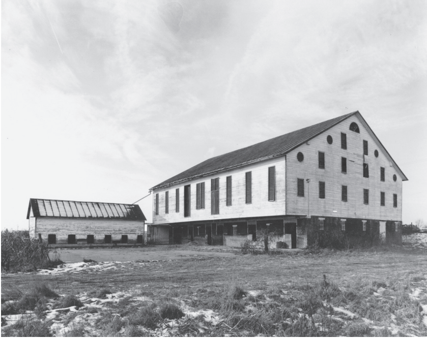
FIGURE 7 Innovative barn designed by Watts for his model farm.

“the placement of the hog pen, perpendicular to the forebay, allowing the hogs to root in the manure, a practice beneficial to the hogs and to the manure.” Watts also built an innovative tenant house, designed for efficiency and as aesthetically pleasing as the barn. 75